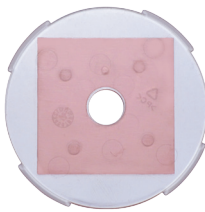
Adhesive box sled