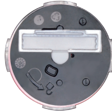
Adhesive tablet sled